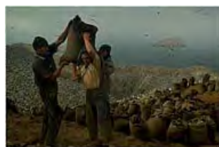
Workers collect guano on Isla Gualaquiza off Peru, which conserves the resource to prevent depletion. Guano's status as an organic fertilizer has increased demand. More Photos

Surging prices for synthetic fertilizers and organic foods are shifting attention to guano, an organic fertilizer once found in abundance on this island and more than 20 others off the coast of Peru, where an exceptionally dry climate preserves the droppings of seabirds like the guanay cormorant and the Peruvian booby.