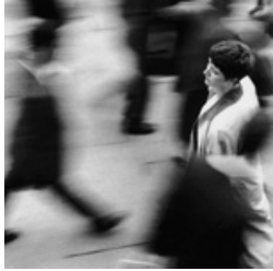
The British Are Here