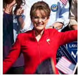
Rogue, Rube or G.O.P. Star: Portraying Palin

Home | World | U.S. | N.Y. / Region | Business | Technology | Science | Health | Sports | Opinion | Arts | Style | Travel | Jobs | Real Estate | Automobiles | Back to Top