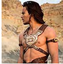
Quaint Martian Odyssey With Multiplex Stopover