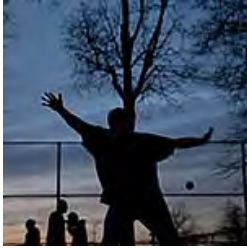
In Queens, Cold Weather Brings Heat to Handball