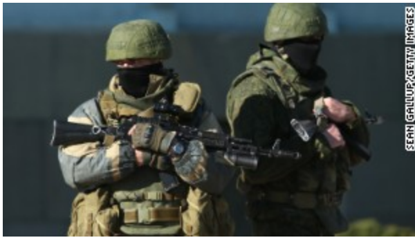
Crisis escalating in Ukraine