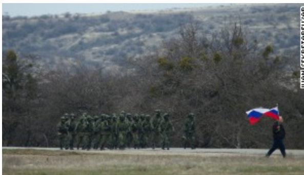
Ukraine: Everything you need to know

Putin's broader plan is to recreate some kind of "Soviet Union lite," a ring of countries under Moscow's control, with the goal of boosting Russia's geopolitical standing. Ukraine