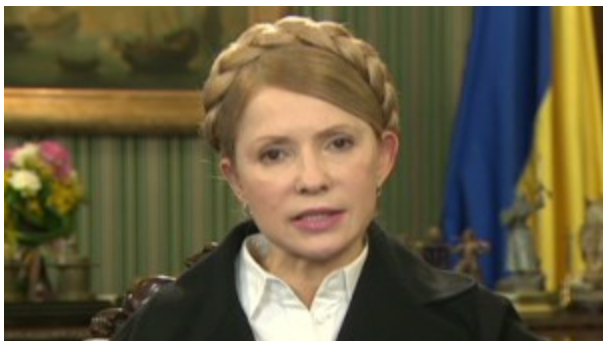
Tymoshenko pleads for help to save Crimea

The current leadership in the Kremlin has never accepted that Ukraine, which achieved independence in 1991, is a sovereign state. It considers Ukraine to be in its sphere of influence, which means that on important issues the country must -- in Russia's view -- ask Moscow for permission.